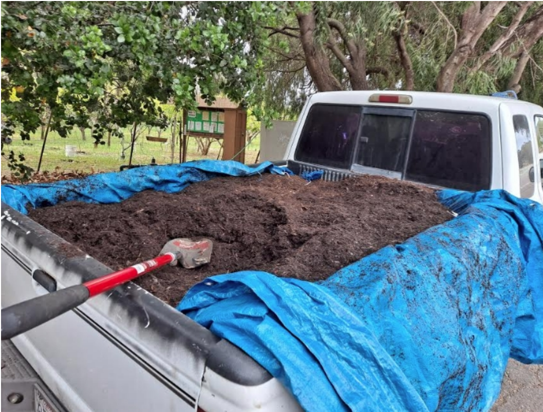
A truckload of gorgeous mulch free from SLO County. We used about a third for the bioreactor.