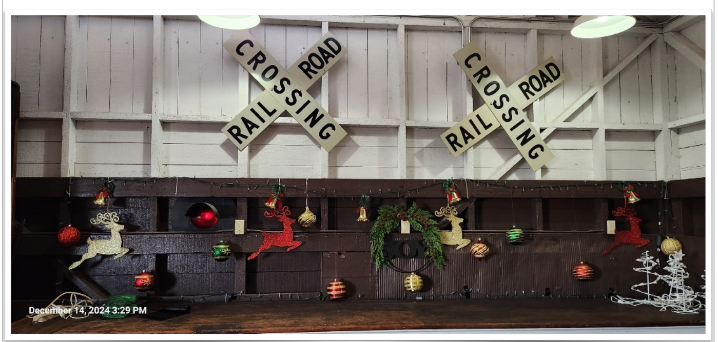
Railroad museum decorations