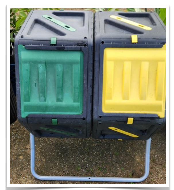
Donated compost bin