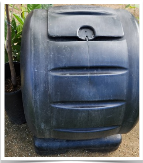
Second donated compost bin