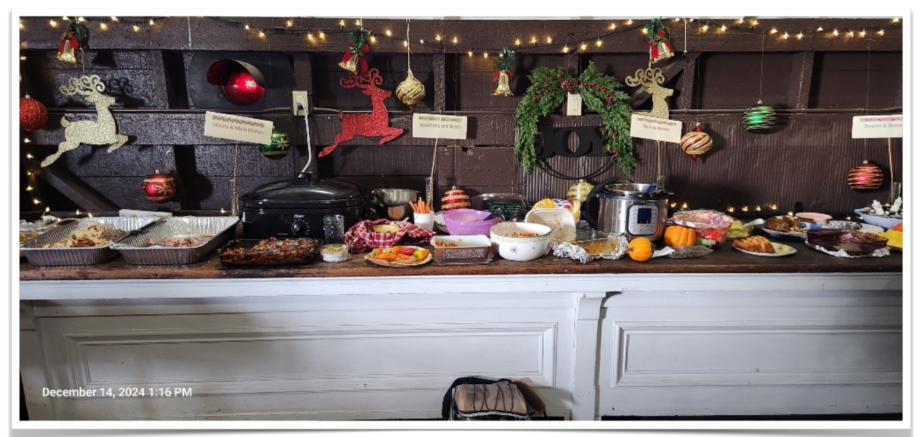
Some of the potluck offerings