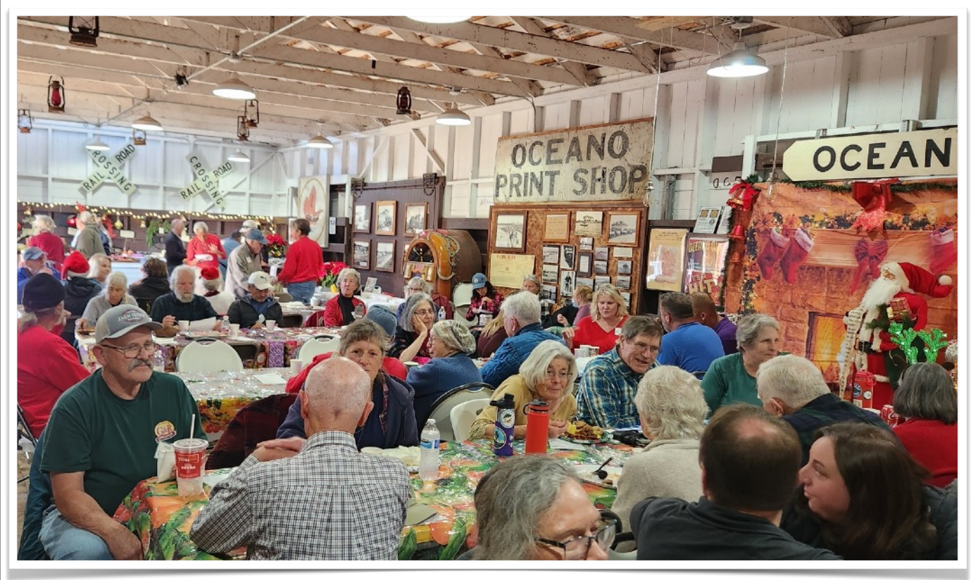
There was a great turnout