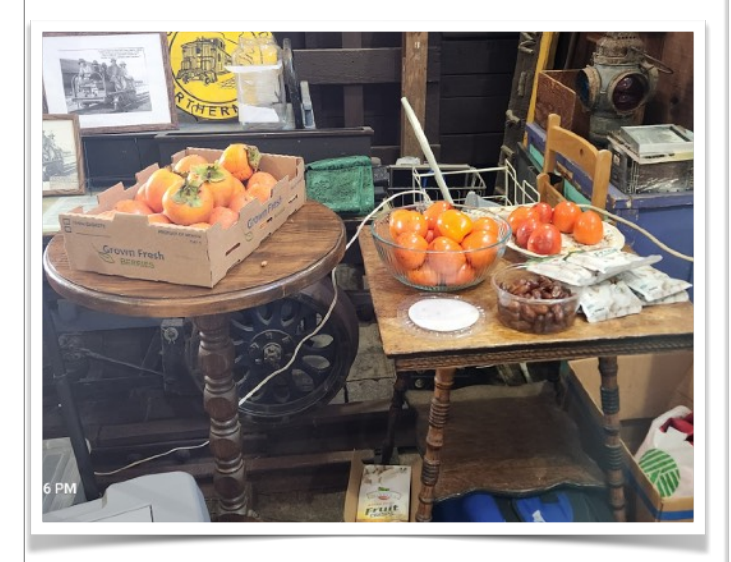
Top: Some of the fruit available

Right: Manny handles the business of the meeting