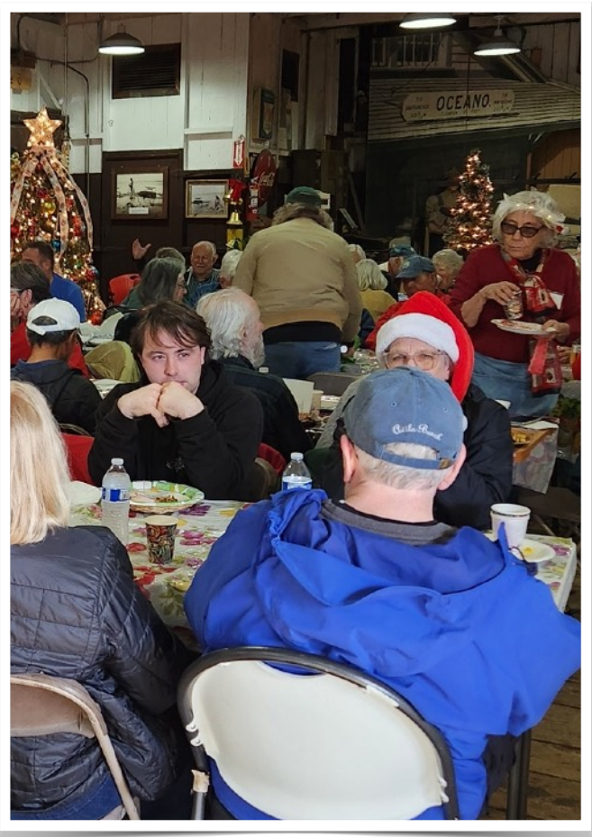
Guests sit and chat