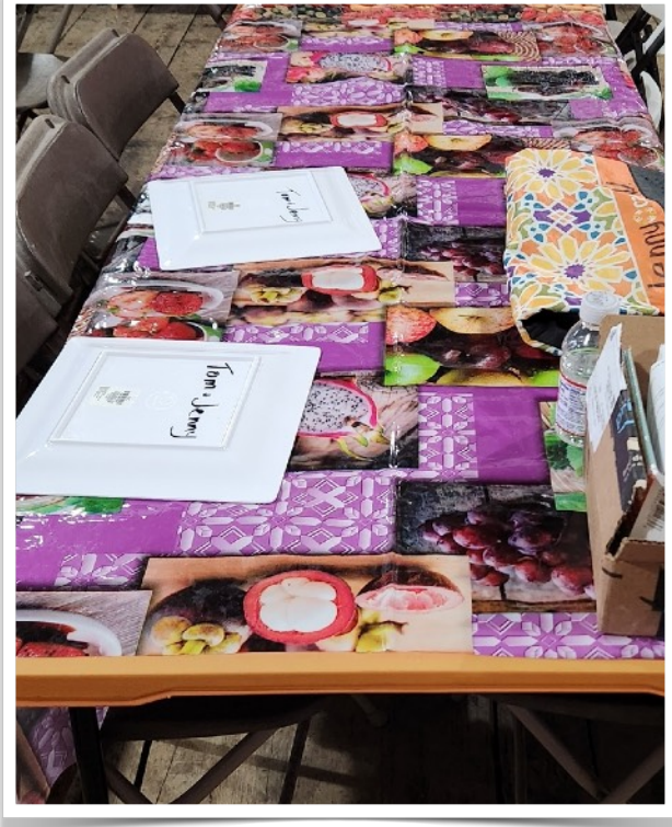
Table decorated with fruit tablecloth