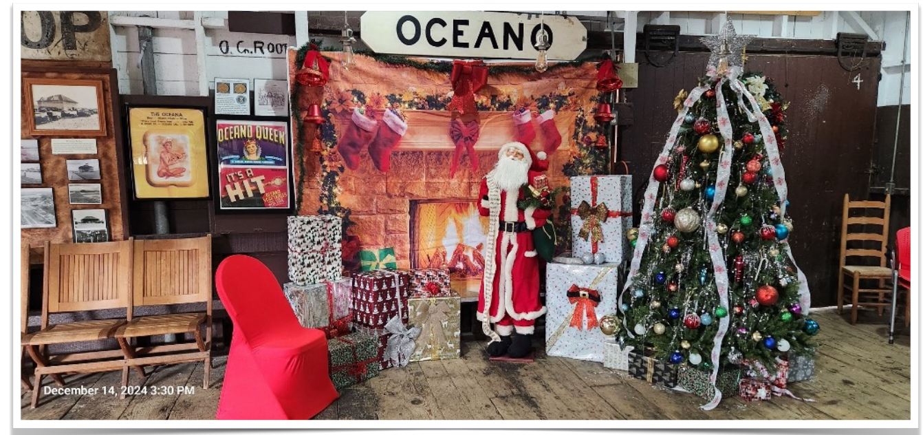
Festive decorations inside the museum