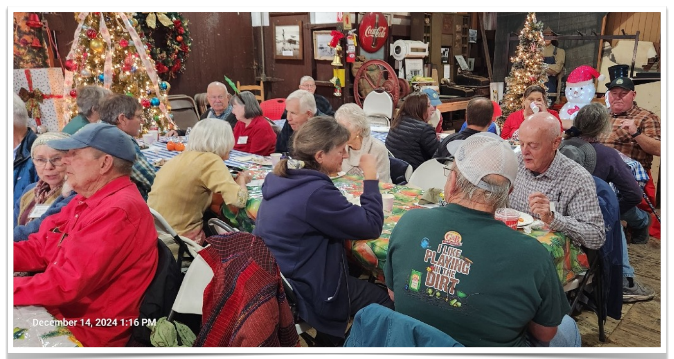
Members chat and eat