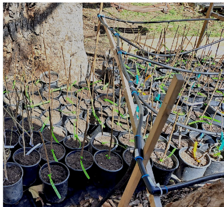
Rootstock ready for sale

Semi-dwarf rootstock, Produces trees about 50-60% of standard. Good resistance to collar rot and fireblight and adapts well to a wide range of soil types and climates. Has a tendency to sucker.