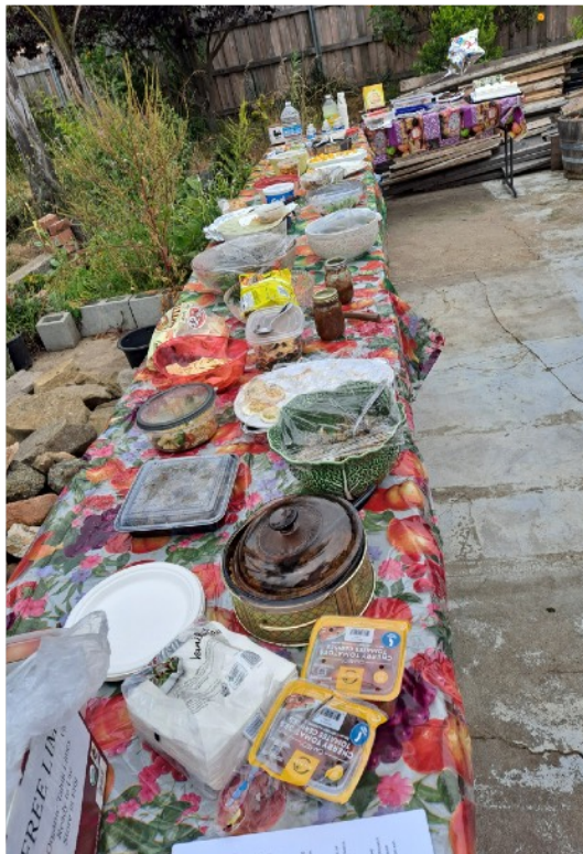
Potluck table