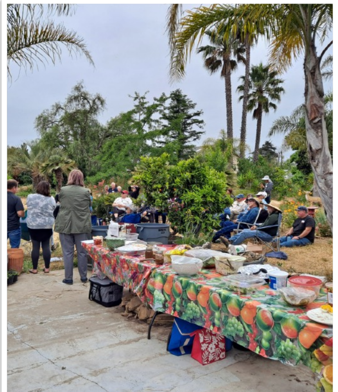
Potluck offerings in foreground, meeting in the background