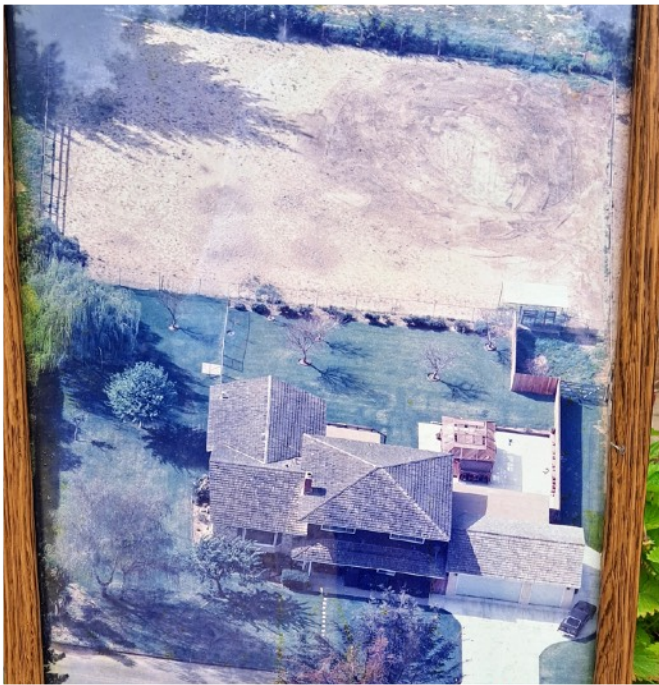
Before garden planting