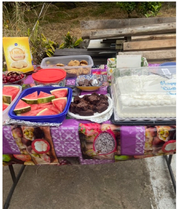
Yummy desserts!