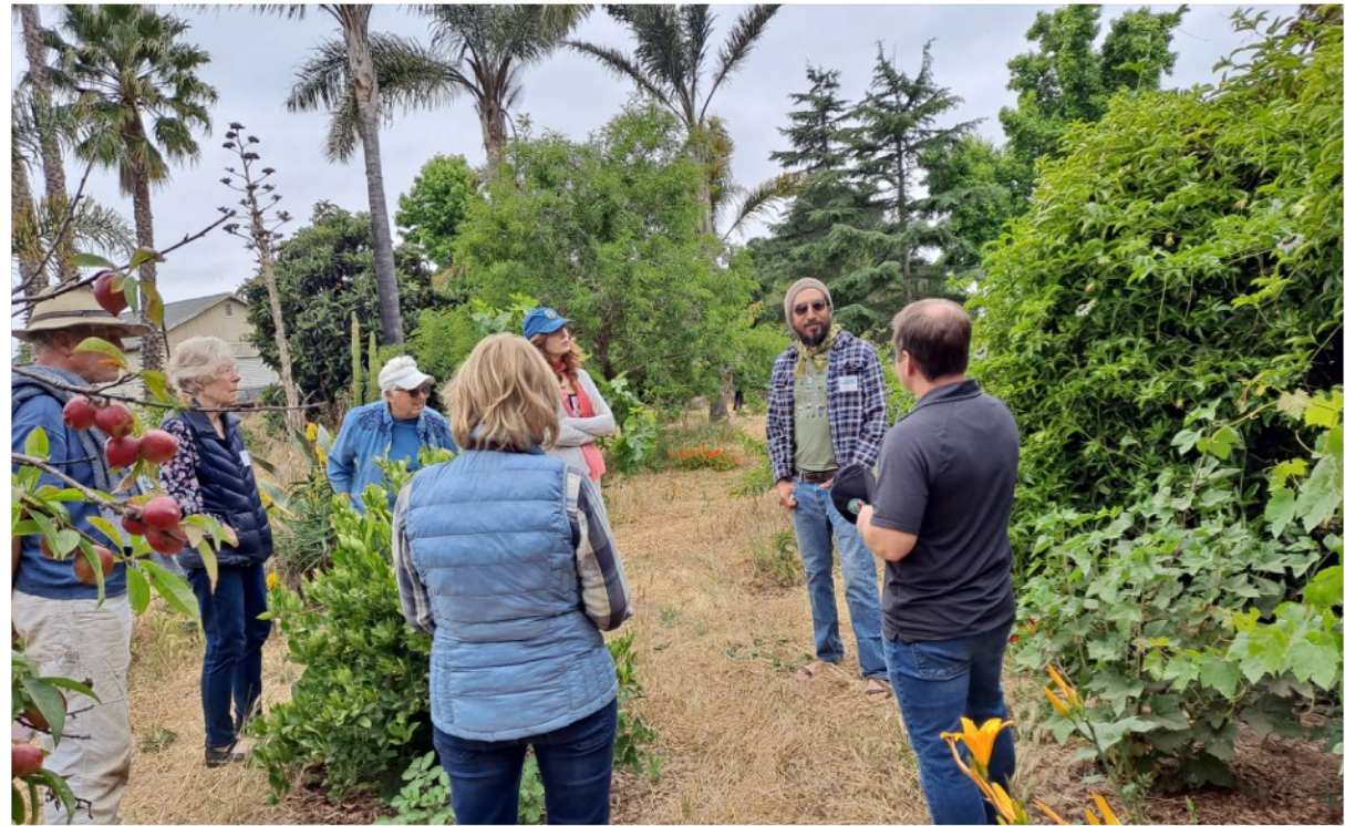
Members ask questions as the garden is toured - Photo by Dara Manker