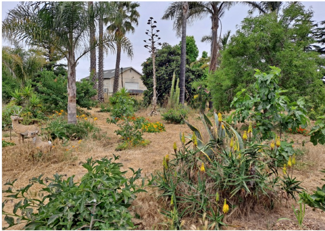
Seth's Garden- Photo by Dara Manker