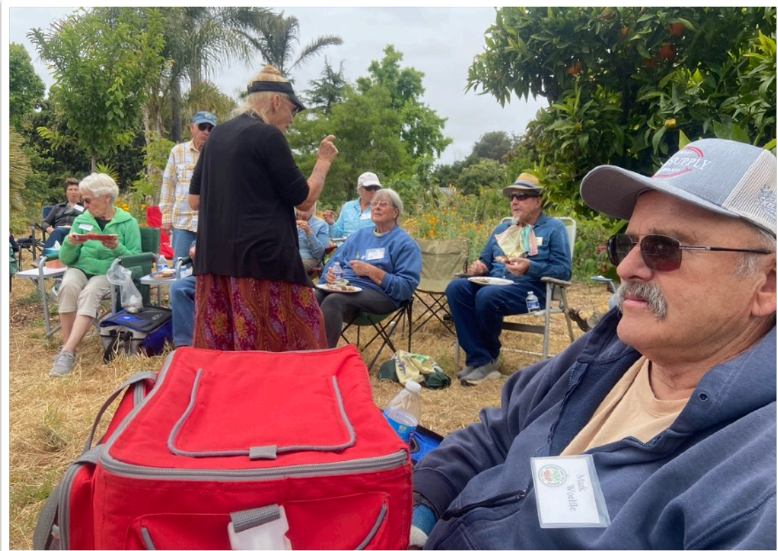
Members enjoying the potluck and conversation