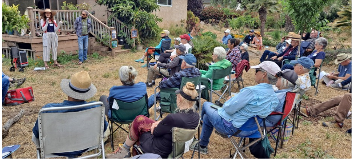
Members listening to the presenters