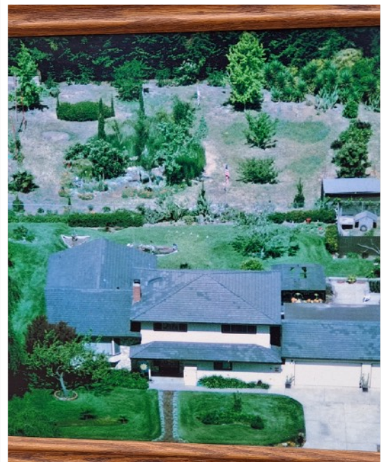
Seth's fathers landscaping