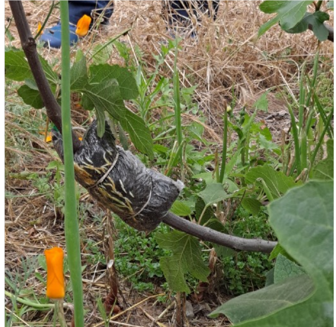
Air layering in progress