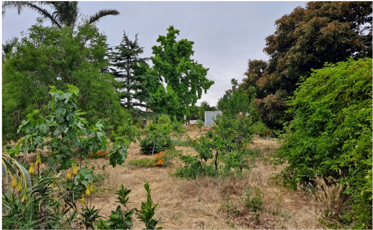
Seth's Garden