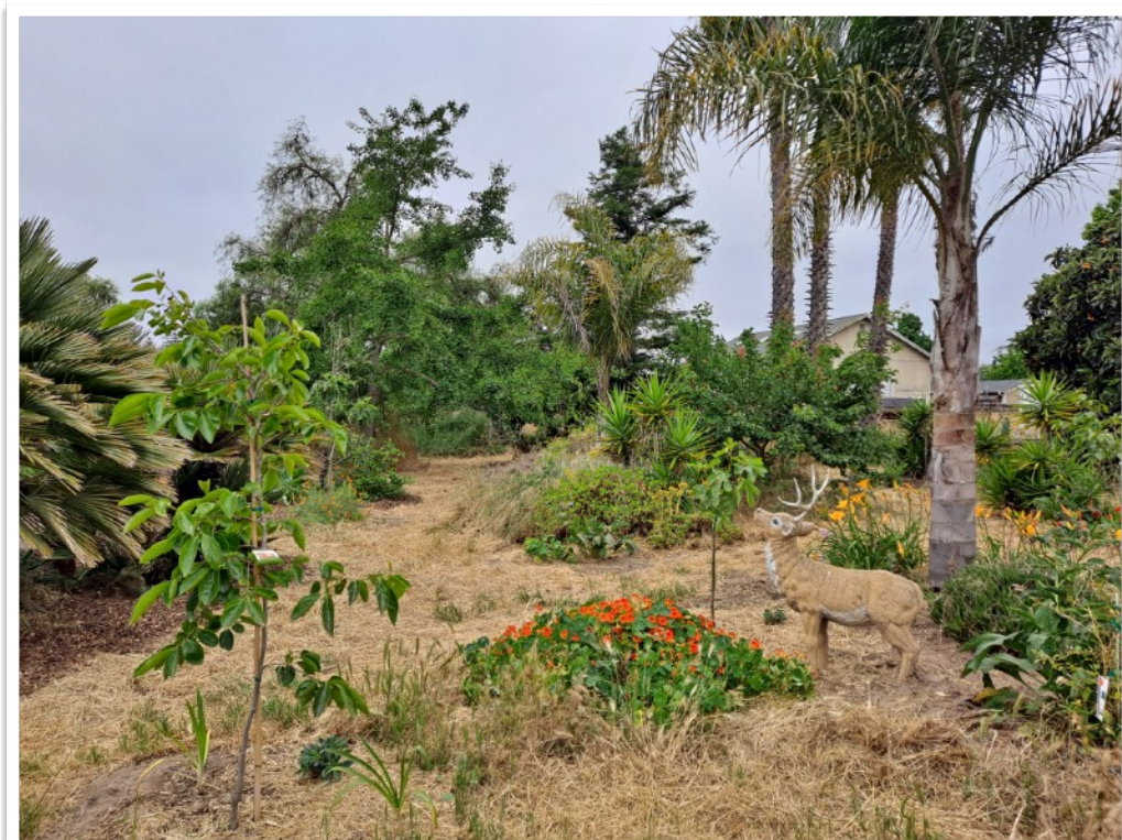
Seth's Garden